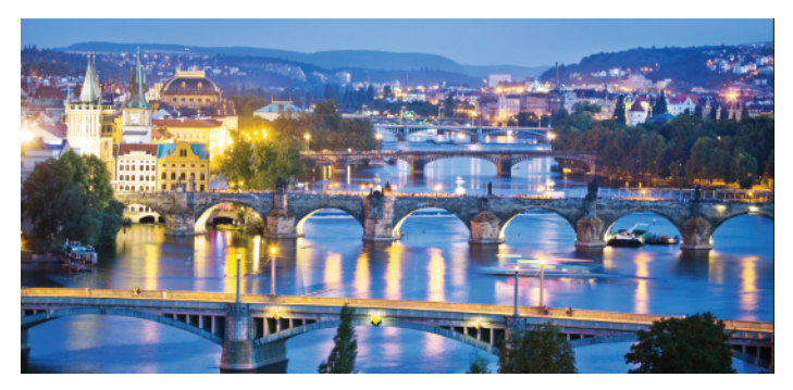
Czech Republic, Prague